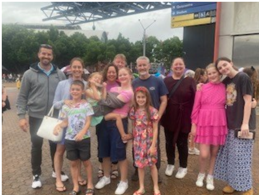
Photo - Here is a photo of myself, my husband, our kids and some of my extended family at the recent NSW Public Schools School Spectacular Festival in Sydney where my eldest daughter danced with her high school dance group.

Interests: Netball, Piano, Swimming, Dance and watching my daughters at their dance concerts / competitions.